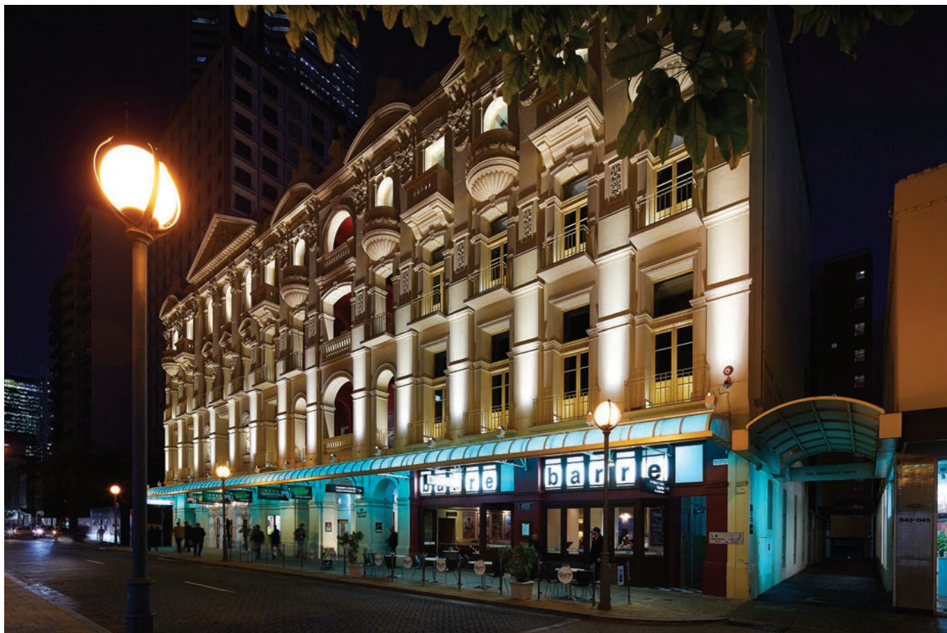
iGuzzini iPro iGuzzini Led Tube iGuzzini Linealuce Mini