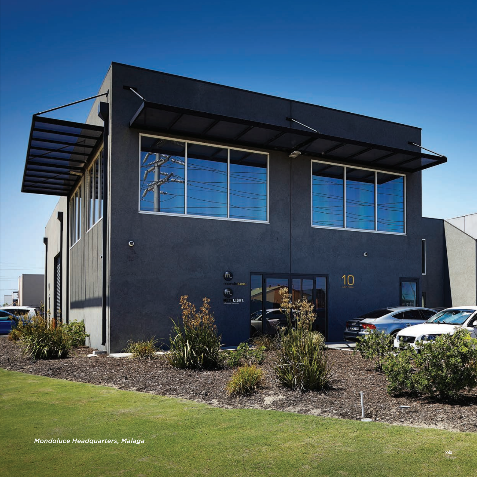
Monduluce Headquarters, Malaga